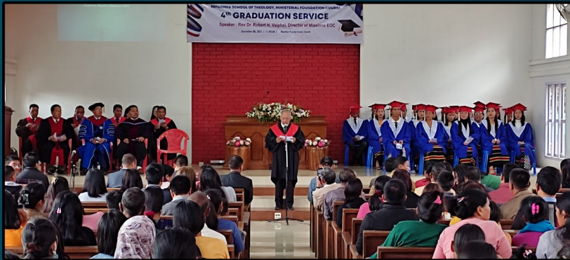
Mualkoi Presbyterian Church ah Reformed School of Theology (ReST) nuai a Ministerial Foundation Course (MFC) graduation hun a zat pih lai