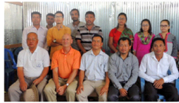
Ningthoukhong school Teaching Staff