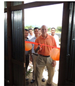
Ningthoukhong school honna