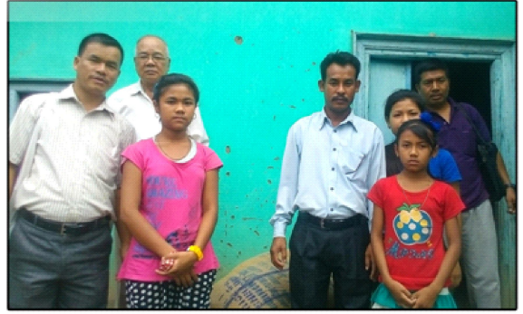
MMF/PMF in Naodakhong ah tagah inkuan khat panpihna pia