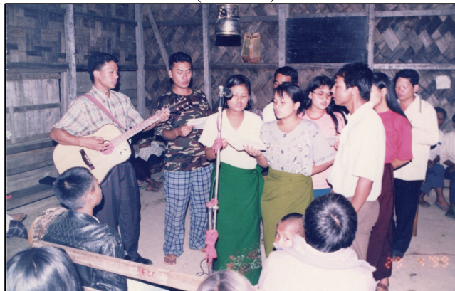
PILAST ten kaihlam ah phatna la toh saptuam veh uh.. 1999