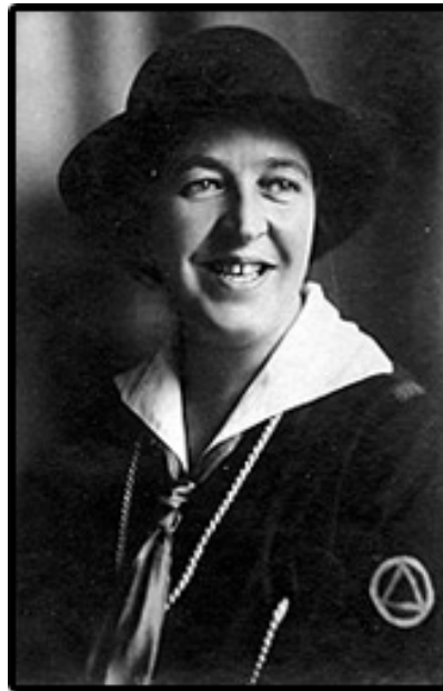
Corrie Ten Boom

Corrie ten Boom tuh kum 91 a phak ni, a pianchampha ni geih in April 15, 1983 in Orange, California ah mual akhumta hi. A pianni geih a si tuh Judate ngaihdan in mi vangpha ahi hi.