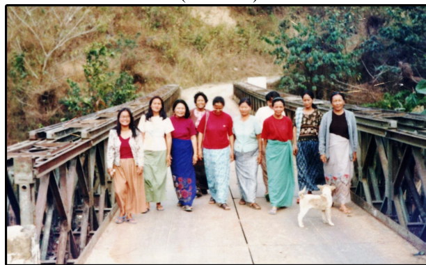
PWF Central Board heutu masate tanggam bial PWF khawmpi uap a azin lai uh