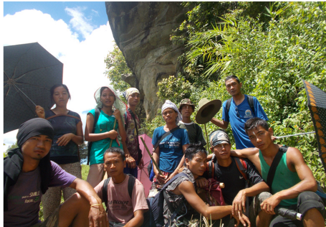
Mualnuam PYF bialvehna limlak