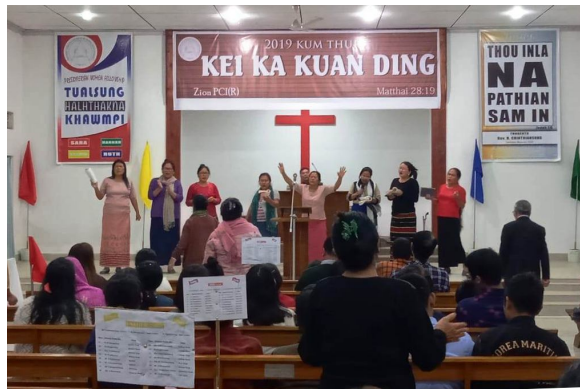
Zion PC in Tualsung khawmpi thupitak in zang