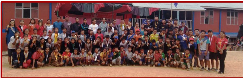
Singgat Rayburn High School in Annual Sport thupitak zangzouta