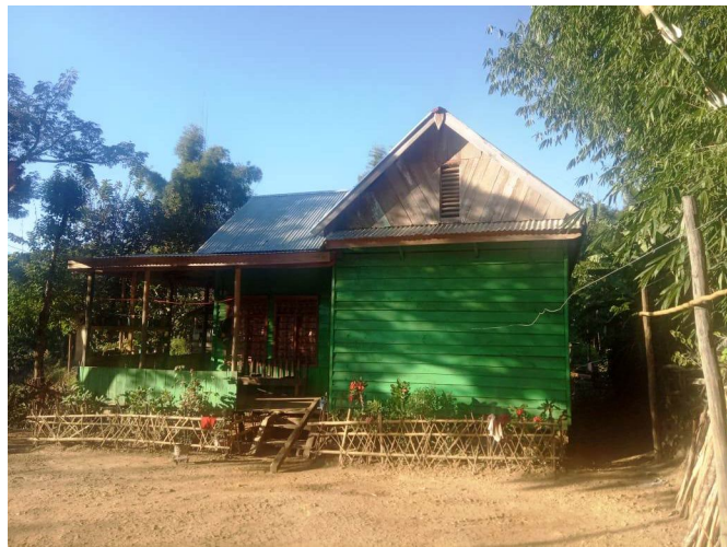
Lhanghoi PC in Pastor Quater ding nei zouta