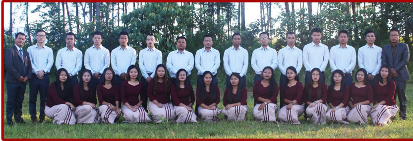
PCI(R) Central Choir in Gospel Music Video La khat utube ah khahkhia