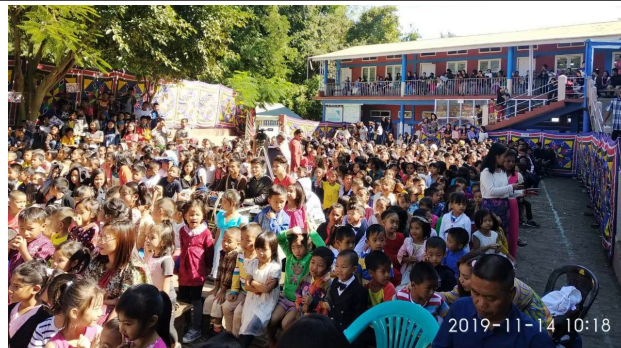
Covenant School in Children's Day thupitak in zang