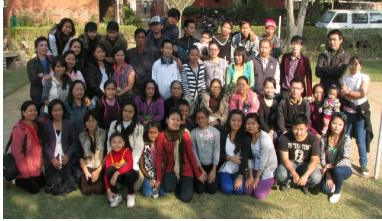
Mi dehsak na hihleh nga pe lou in a mat didan hihl zaw in.