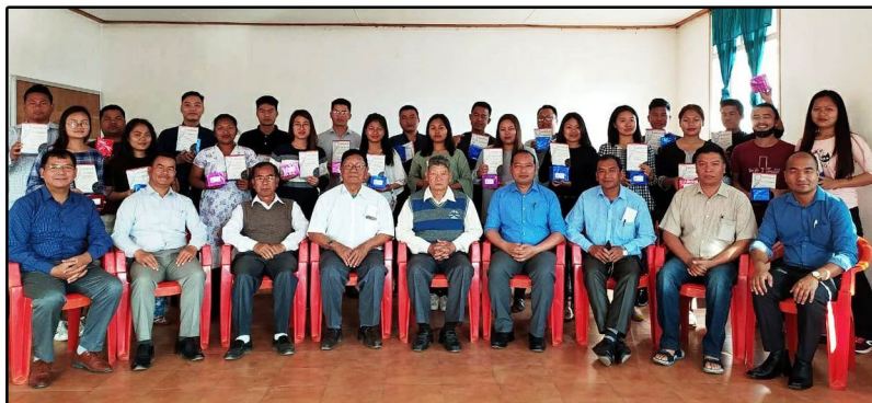
Music Upliftment Committee makaih in PCI Central Choir memberbe pahawina. kipahpihna leh hanhawanna hun zat in om